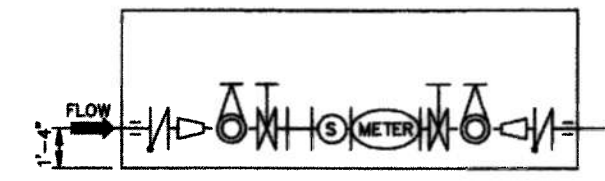
ALTERNATE PLAN VIEW (SEE NOTE 3 ON COVER PLATE PLAN)