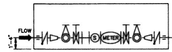
ALTERNATE PLAN VIEW (SEE NOTE 3 ON COVER PLATE PLAN)