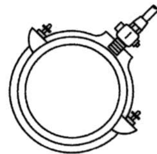
WIDE BAND SINGLE SADDLE OR DUAL SADDLES

BLOW-OFF & CHLORINATION TAPS ARE MADE IN VERTICAL POSITION